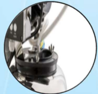
SS 316 grade flow control mechanism