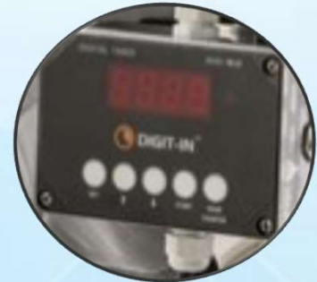
Digital timer with inbuilt hour counter