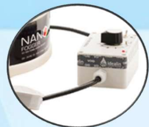
Electronic timer (Adjustable 5- 60 min)