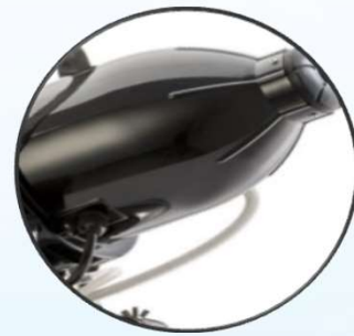
SS 316 grade Nozzle Assembly