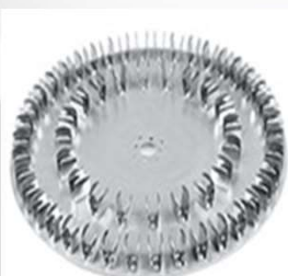
Cat. No.: 18900160 Type 1 plate 60*1.5ml centrifuge tube