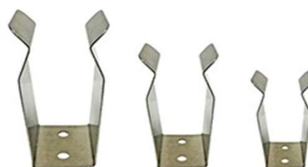
Stainless steel clip Cat No.: 18900196, for 1.5ml centrifuge tube Cat No.: 18900197, for 15ml centrifuge tube Cat No.: 18900198, for 50ml centrifuge tube