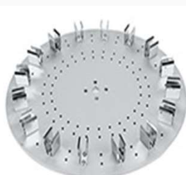
Cat. No.: 18900161(Optional) Type 2 plate 16*15ml centrifuge tube